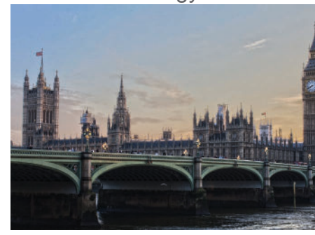
Local & Central Government